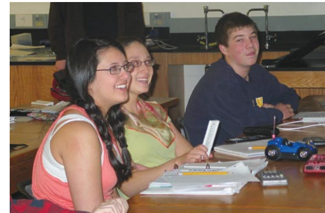
Physics students weigh-in to the discussion using CEEF-funded ‘Clicker’ technology