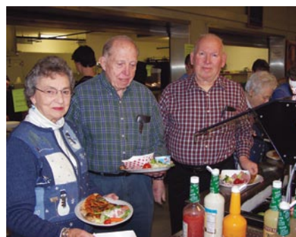
Students and seniors alike enjoy the chef-of-the-month fare at the revamped CEHS cafeteria