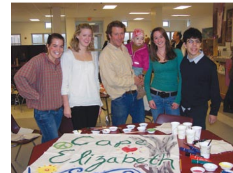
Flatbread Day was enjoyed by many. The Chef-of-the-Month at CEHS is a component of the Wellness Committee grant.