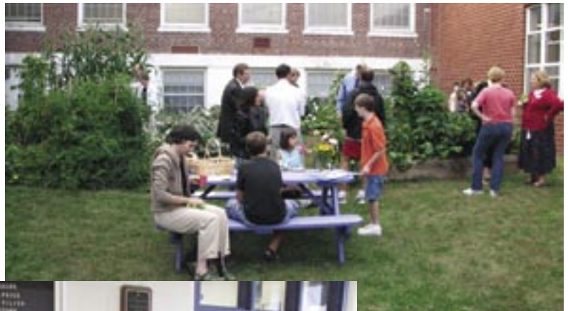
Students proudly tour the magnificent garden with their guests at the first annual harvest garden party this September.