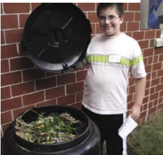
Recycling and composting techniques fill out the broad curriculum the gardening experience has offered. From pre-season seed orders and building materials for the raised beds to hauling soil and water, the students have managed every aspect of work a project like this entails. Community members, town employees and the Jordan Farm family have all lent their support as well.

Teachers, administrators and CEEF board members received beautiful hand-made invitations to the first Harvest Garden Party in September. Full bloom doesn't aptly describe the sumptuous gardens the students showed off that day. The students' buffet was filled with many delectable treats: homemade bruschetta made with their own herbs and tomatoes, an eggplant spread, cucumber sandwiches and a homemade mint lemonade to select a few favorites.