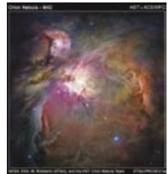
The most recent image taken of the Orion Nebula by the Hubble Space Telescope.