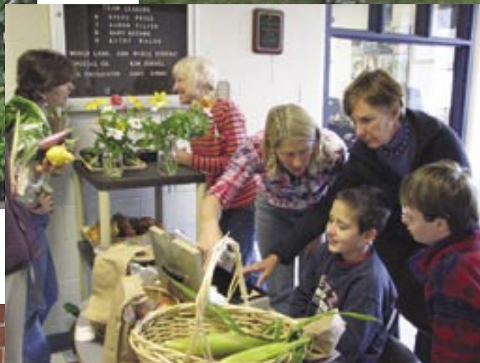
Students offer a "farmers market" every Friday at lunchtime.