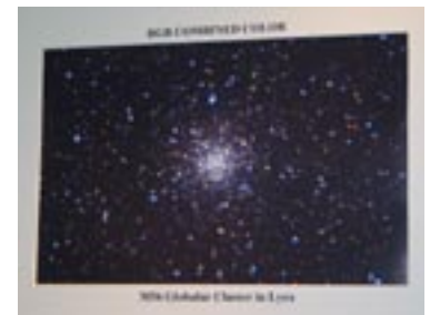
An example of the stars we can't 'see'

lowed our students to peer into the night sky and see objects that could not be seen with the naked eye, but allowed our students to collect and analyze data from the far reaches of the universe. This process gave them a better understanding of how our planet fits into the bigger scheme and greater appreciation of the complexities of the universe firsthand.” The photos taken were featured in an astronomy photography exhibit at the Thomas Memorial Library this spring. The collaboration with SMA will continue into the next school year. For more information on the astronomy grant, please visit our website, capeeducationfoundation.org .