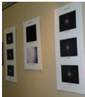
Display hallway at TML